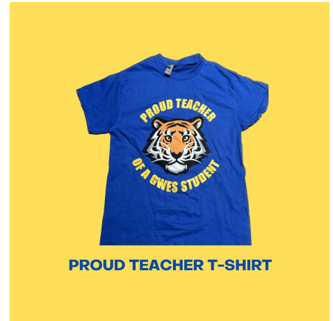
PROUD TEACHER T-SHIRT