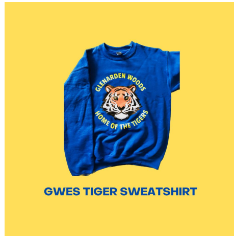
GWES TIGER SWEATSHIRT