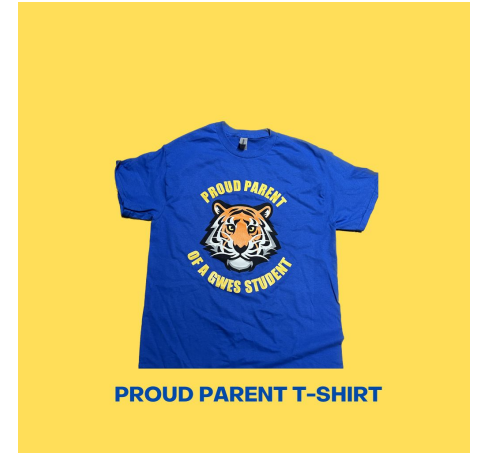
PROUD PARENT T-SHIRT

Please visit email www.gwespta.org to visit the store!