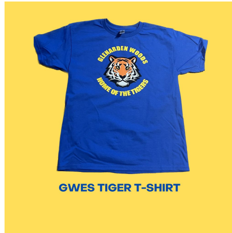
GWES TIGER T-SHIRT